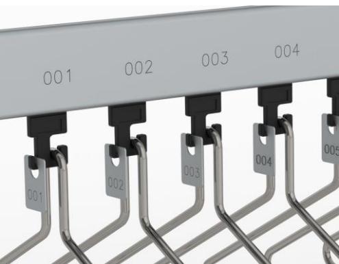
Issue tags & numbering