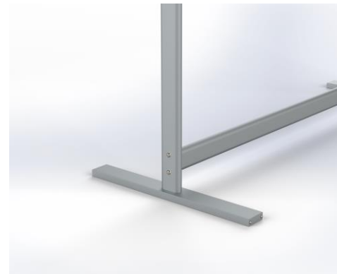
Free standing base