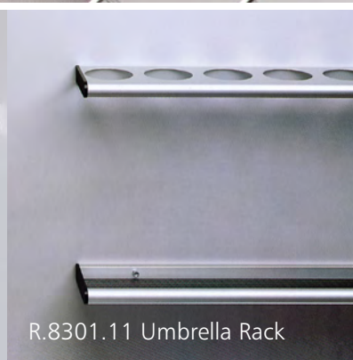
R.8301.11 Umbrella Rack