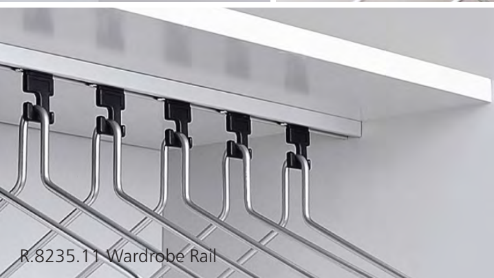
R.8235.11 Wardrobe Rail