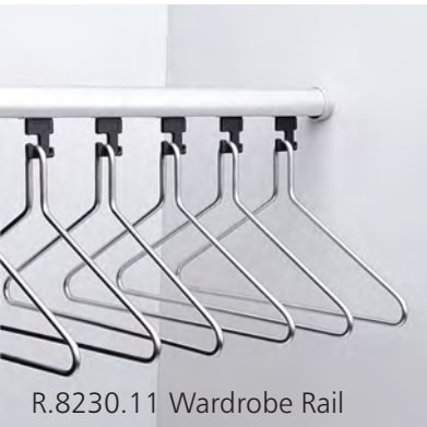
R.8230.11 Wardrobe Rail