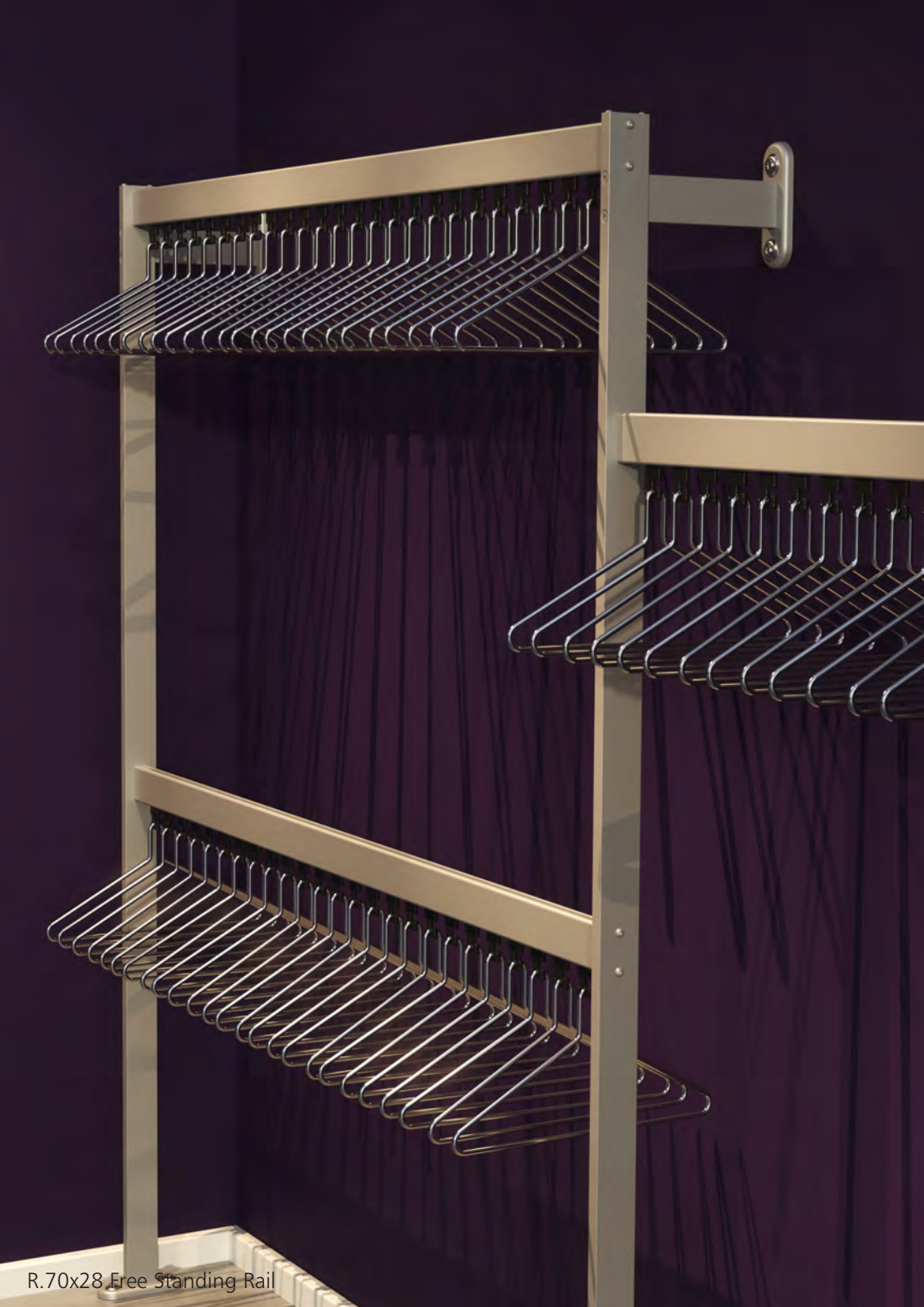
R.70x28 Free Standing Rail