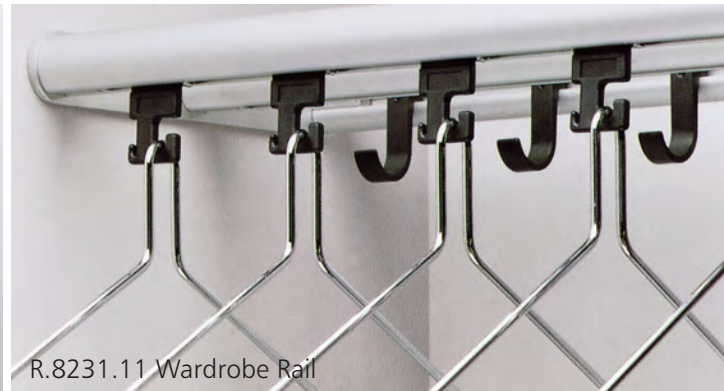
R.8231.11 Wardrobe Rail