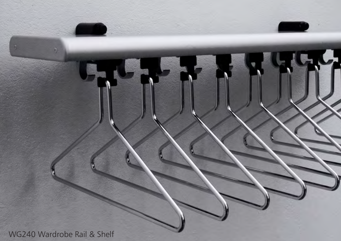
WG240 Wardrobe Rail & Shelf