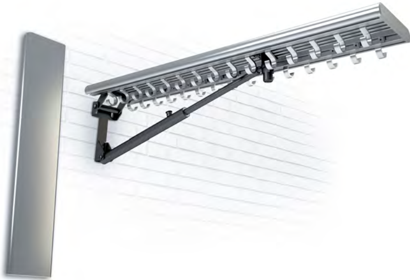
KG240 Folding Coat Rack