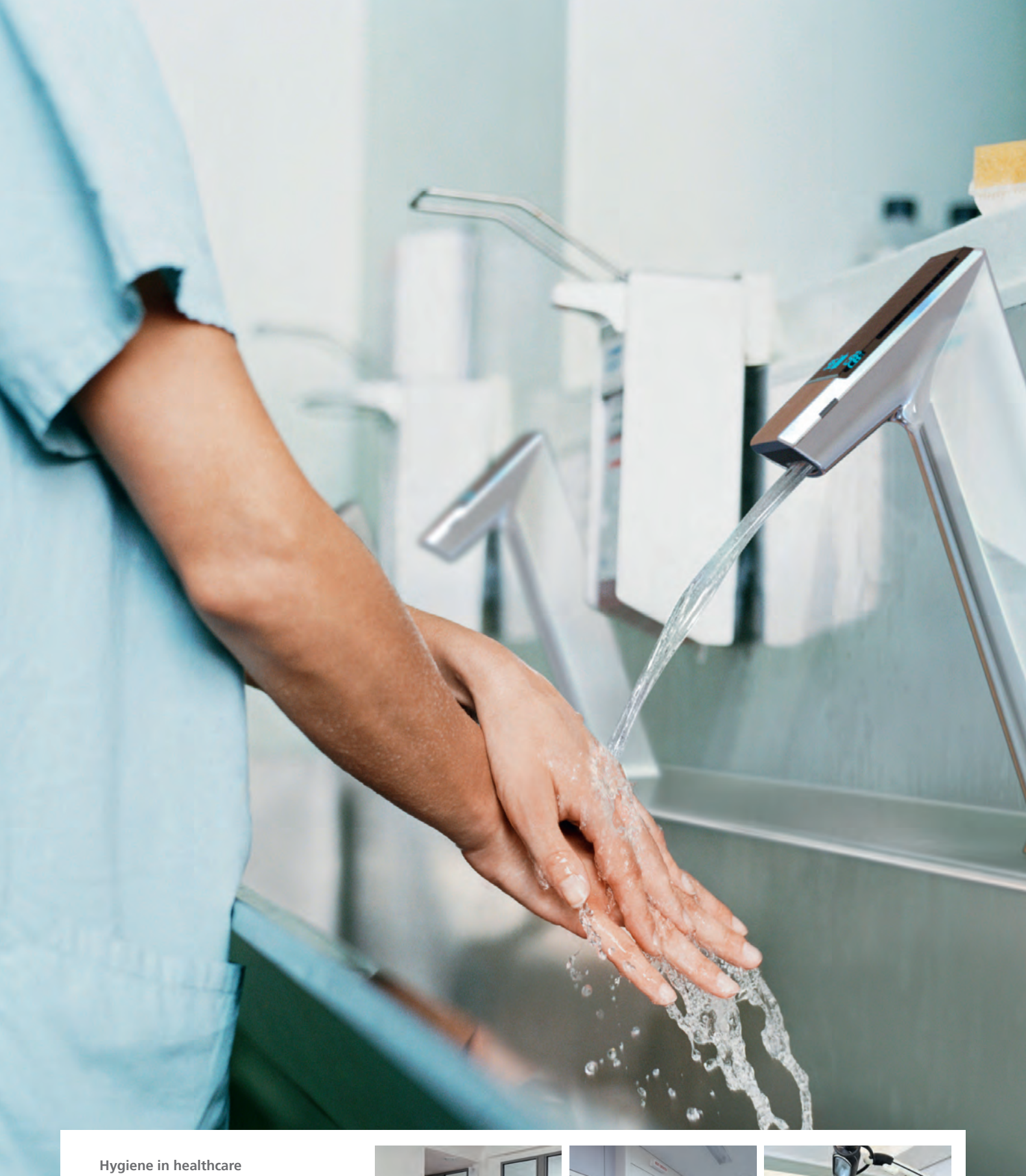
Hygiene in healthcare Medical practices / hospitals care homes / nursing homes