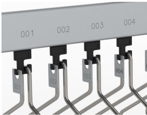
Coat Hangers – with numbering and issue tags